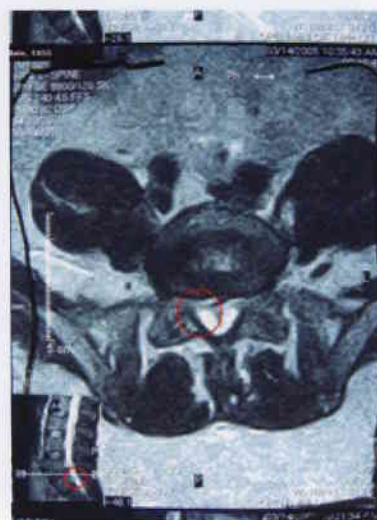
Figure 1d: Post-treatment MRI (03/14/05)

A 50-year-old male with herniated disc at L5-S1. Severe low back pain radiating down into the right leg with straight leg raise of 10° (on the right). Received IDD Therapy in February 2005 and by March 2005 the patient had straight leg raises of 90 degrees and no pain.